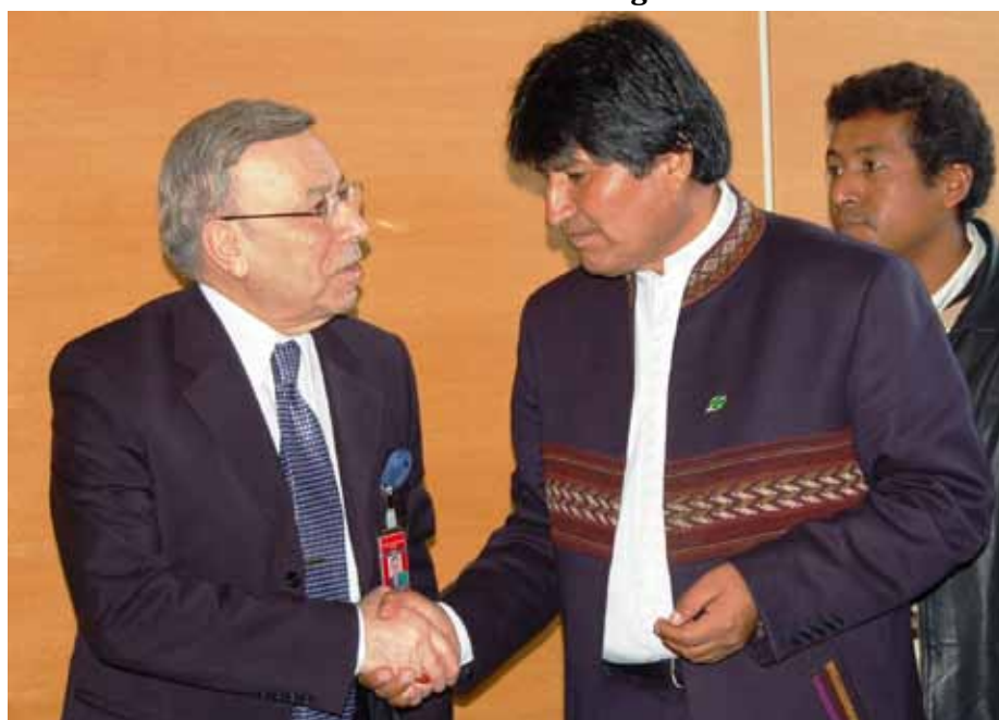
INCB President Hamid Ghodse meets the President of the Plurinational State of Bolivia, Evo Morales, on 12 March 2009 during the high-level segment of the fifty-second session of the Commission on Narcotic Drugs.

INCB President Hamid Ghodse met with the President of the Plurinational State of Bolivia, Evo Morales, to discuss the control regime for coca leaf, during the high-level segment of the fifty-second session of the Commission on Narcotic Drugs in March 2009.