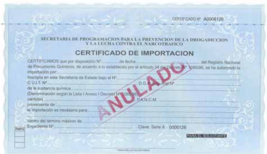
An example of an import certificate, used by Governments to verify the legitimacy of shipments of internationally controlled substances.

Successful electronic tools that have been developed through close cooperation between INCB and the UNODC Information Technology Service are the National Drug Con-