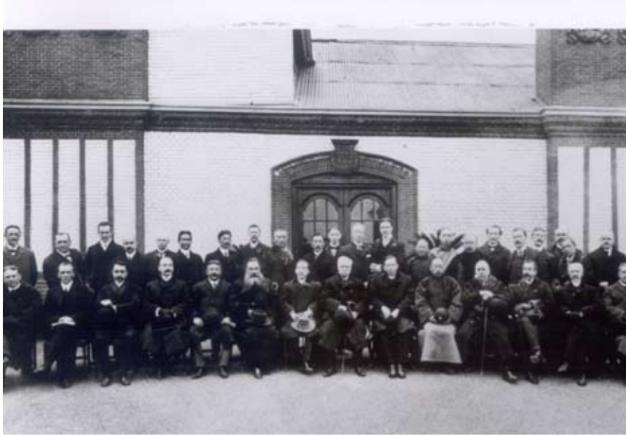
The International Opium Commission in Shanghai in 1909 (United Nations Office at Geneva).

N ext year, the current international drug control framework will celebrate its one hundredth anniversary. On 26 February 2009, the Government of China will host an event to commemorate the meeting of the first International Opium Commission, which took place in Shanghai in 1909.