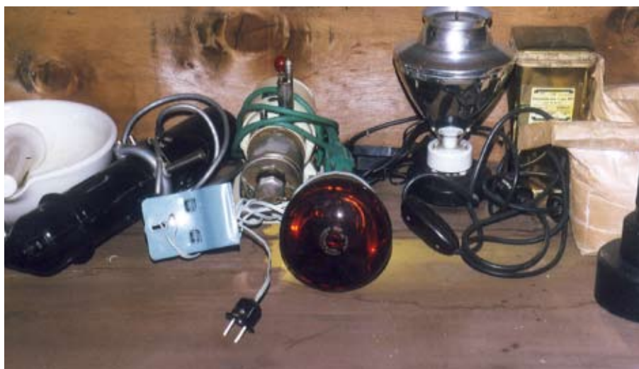
Instruments used to make heroin from opium in Afghanistan.

I n June, the Security Council called upon all Member States to improve monitoring of the international trade in chemical precursors used to make heroin in order to better combat drug trafficking in Afghanistan.